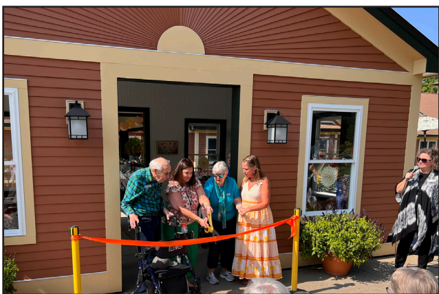
Cedar Landing Ribbon Cutting Ceremony