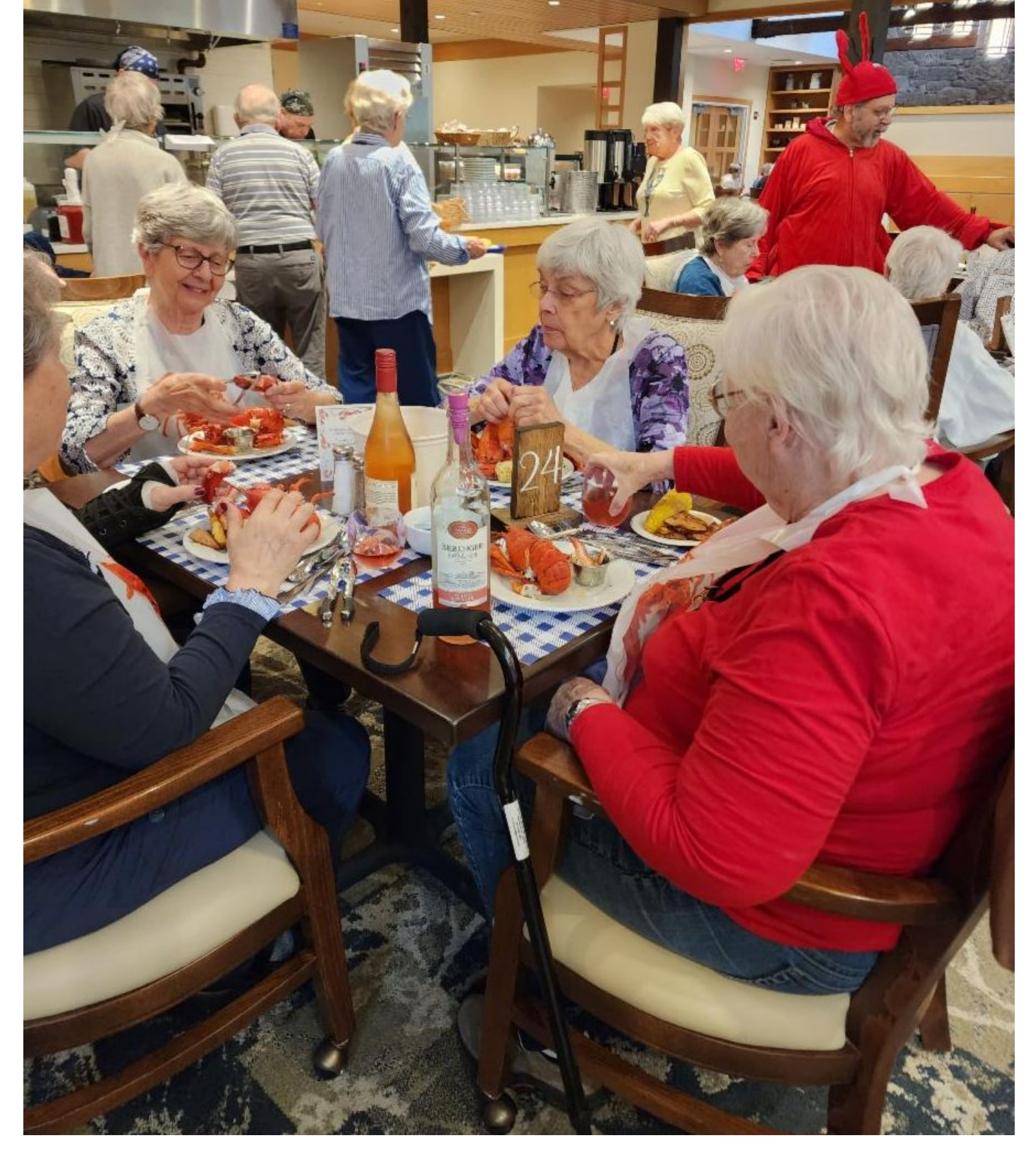
Residents enjoying their lobsterfest feasts!

For many people, lobster is a special treat involving a bit of work to eat it. When you ramp that up to the level of Wake Robin's annual Lobster Fest, it's a whole new level of planning. The prep work starts three days before the meal and includes steaming 375 lobsters in our kitchen. We offer diners the option of crack-your-own or what is referred to as "lazy man's lobster" where someone else has done the work for you.