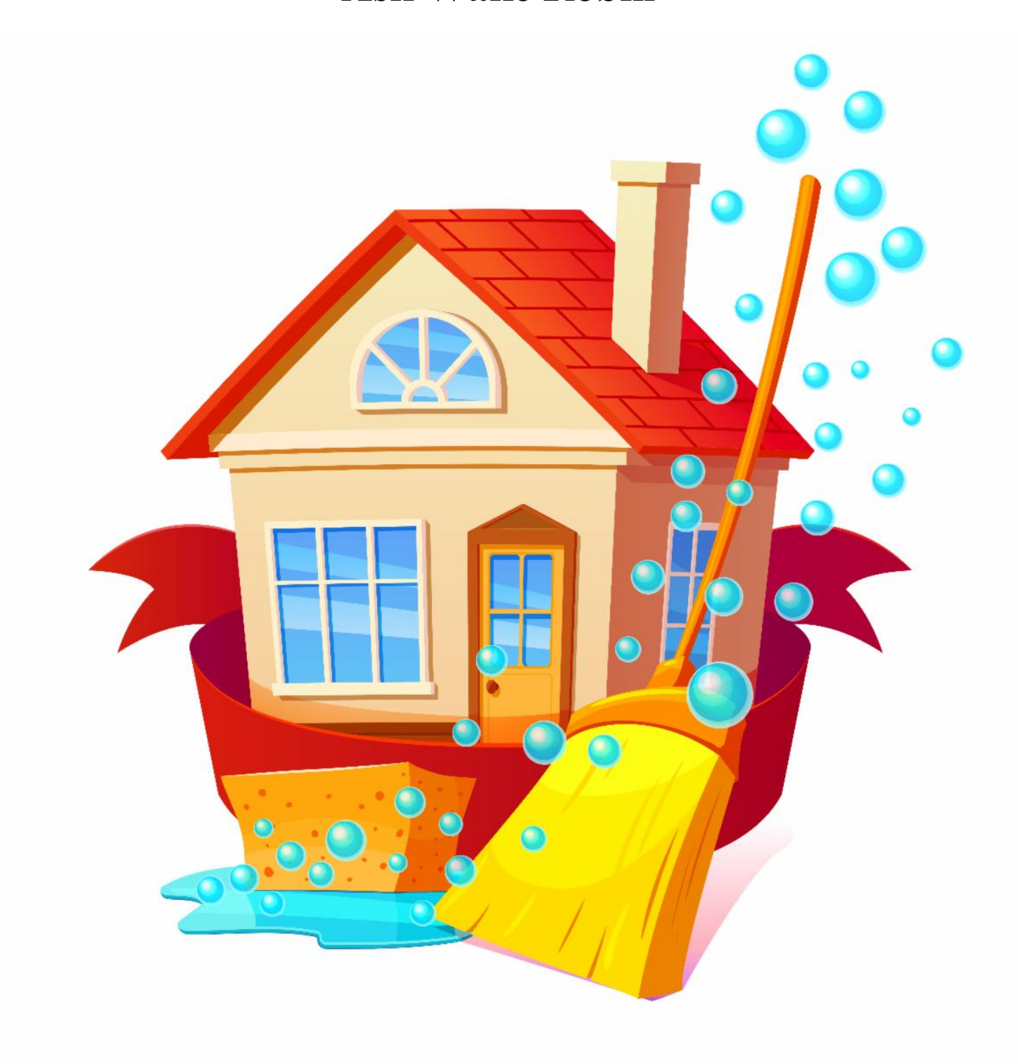
Question of the Month: The Cleaning team at Wake Robin - How can I do that at home?

Over the months of these e-newsletters, you have read about our various "green efforts." Among them are the use of CFL and LED light bulbs, tankless hot water heaters, low-flow toilets and faucets, and kitchen composting. We have made a serious commitment to recycling and all of these practices are part of life at Wake Robin.