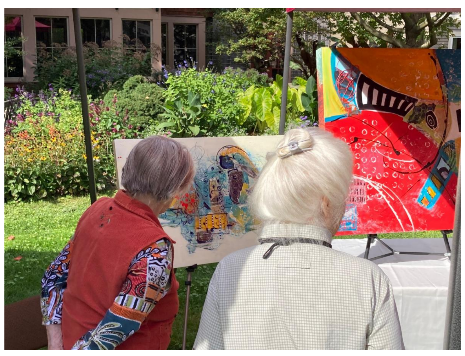
Priority Depositors get invited to Wake Robin events - like the Art Hop!