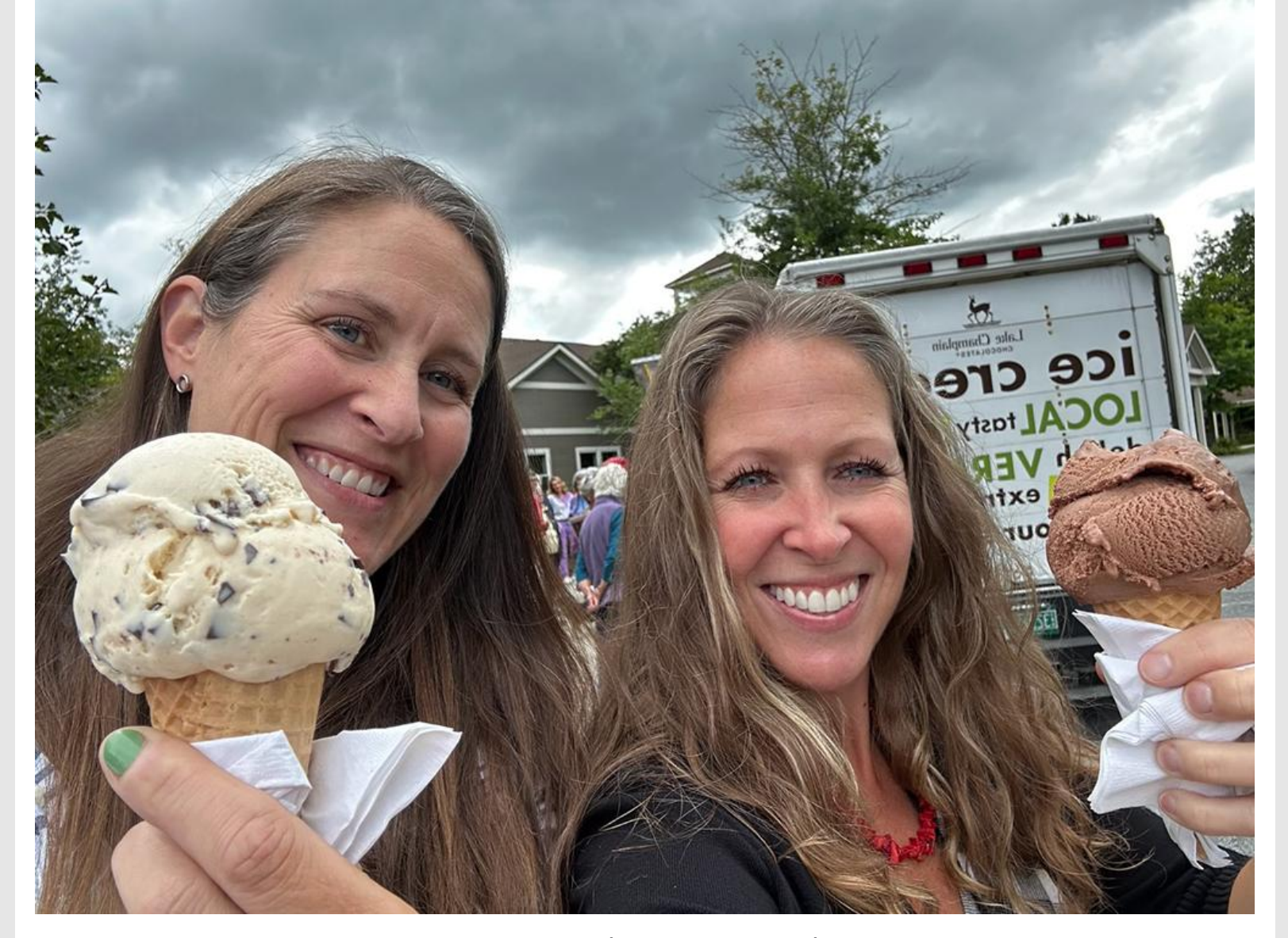
Ice cream makes everyone smile!

How do you get a group of people to do something that isn't really on anyone's list of "things I want to do?" Sometimes a sweet incentive works, a friendly form of bribery.