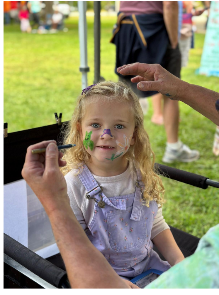
Wake Robin's participated in the Shelburne Farmers Market by sponsoring face painting by The Fun Factor Inc.